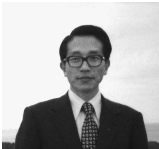
Fig. 1. Akira Endo, the discoverer of the first statin drug in 1976 (27).

By a most remarkable coincidence, a British group at Beecham Laboratories in the United Kingdom, while searching for antibiotics, independently isolated precisely the same compound as Endo's ML-236B from a different but related mold and at almost the same time (35). They named it compactin. However, the Beecham workers were narrowly focused on antibiotics, and in that arena compactin was not particularly effective, so it was dropped from the Beecham program. They did not appreciate until later, after Endo had published on its potency as an HMG-CoA reductase inhibitor, what a treasure they had had in